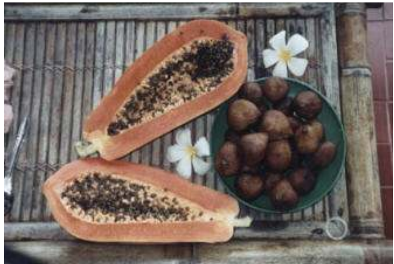
papaya and salaks